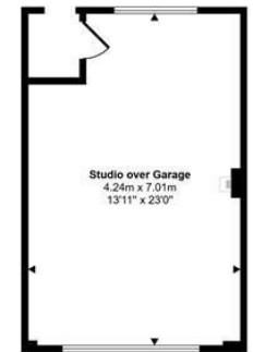
Studio Approx 31 sq m / 333 sq ft

This floorplan is only for illustrative purposes and is not to scale. Measurements of rooms, doors, windows, and any items are approximate and no responsibility is taken for any error, omission or mis-statement. Icons of items such as bathroom suites are representations only and may not look like the real items. Made with Made Snappy 360.