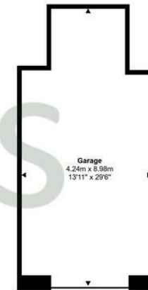
Garage Approx 34 sq m / 369 sq ft